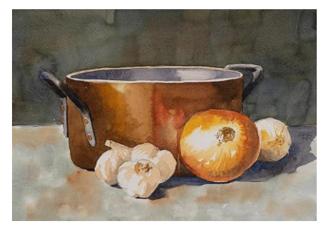
Honorable Mention Pablo Rivera "Copper Pot"